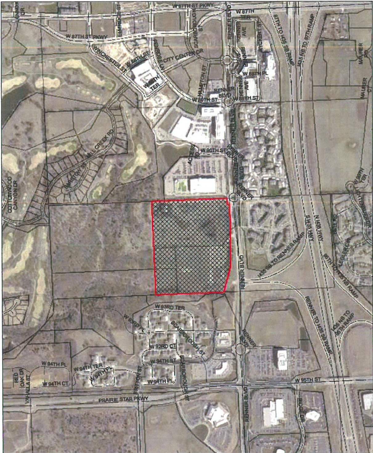
Exhibit D Project Plan 5 Area